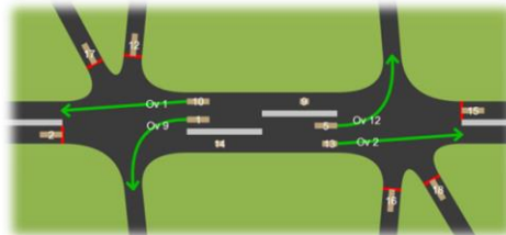
Sample MaxTime status display as viewed from front panel, tablet or smartphone (no app required)